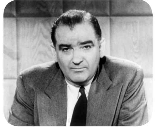
Senator Joseph McCarthy

8 The reason why we find ourselves in a position of impotency is not because our only powerful potential enemy has sent men to invade our shores, but rather because of the traitorous actions of those who have been treated so well by this Nation. It has not