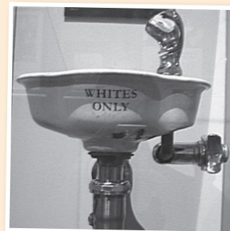
Rosa Parks - Civil Rights Activist

Evaluate the novel as a reflection of the time in which it is set and the time during which it was written.