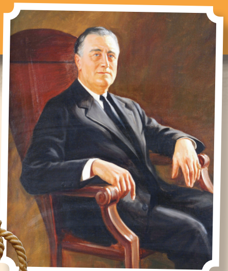
Franklin Delano Roosevelt 32nd President of the United States 1933-1945