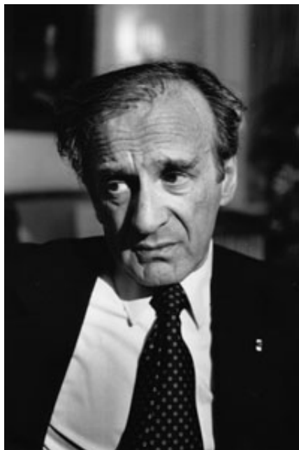
Elie Wiesel (1987)

the author's memories, feelings, and interpretations of these incidents. However, because the author selects the incidents included in the memoir, a memoir cannot always be taken as the absolute objective truth about a person's life. Memoirs, by their very nature, are subject to the author's biases, and the author may present events differently from the way in which they actually occurred. Authors will often structure their memoirs to create specific emotional effects on their audience. When reading a memoir, one must be wary of accepting uncritically the author's presentation of events. This is not to imply that the events in question did not occur. Still, readers must consider the possibility that the author is manipulating these events and their presentation for artistic effect.