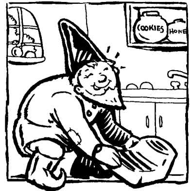
The GNOME rearranged his den to make it more ERGONOMIC.

The ergonomic layout of the cockpit helped the pilots focus on flying and reduced their work-related injuries.